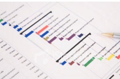
PRECONSTRUCTION & DESIGN